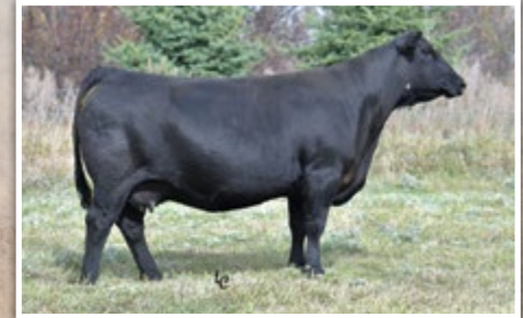
KS MISS TANKER Y552