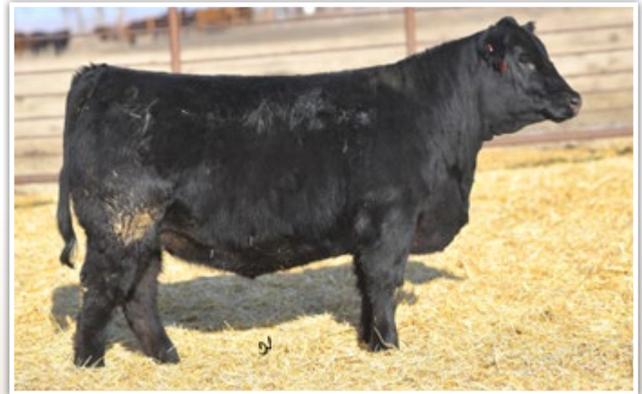
BCLR MISS EVENT F818 • DAM OF LOTS 36-37