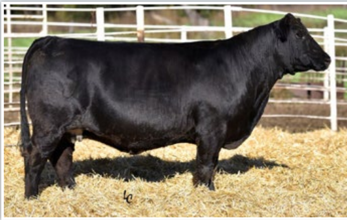
TJ 15T • DAM OF LOTS 100-101