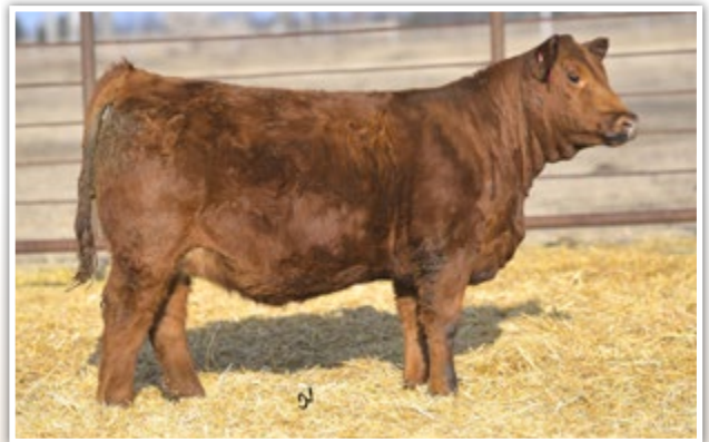
BCLR MISS YANKEE F870