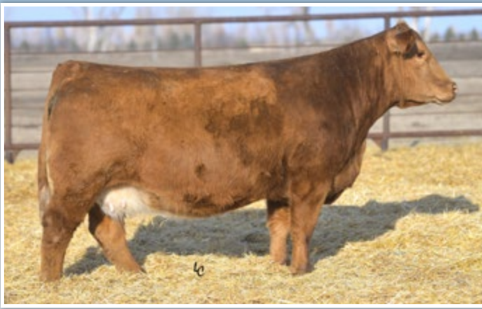
BCLR MISS AUTHORITY A301 • DAM OF LOT 9