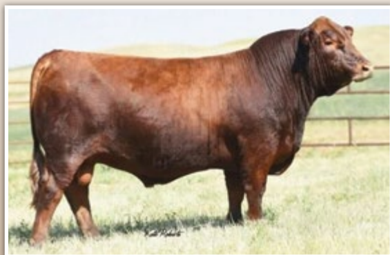
CDI PERCEPTION 254E • SIRE OF LOTS 63-65