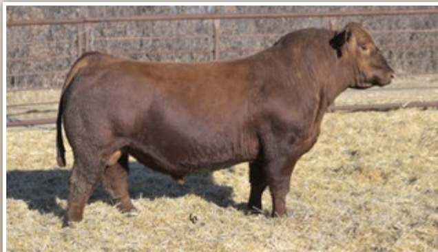
9 MILE ABUNDANCE • SIRE OF LOTS 60-62