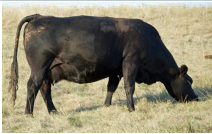
KS MISS DENSITY A482 • DAM OF LOT 54

A482 has been a great cow. She put a feature bred in our sale last year and has produced one of our best Manifesto sons for this sale.