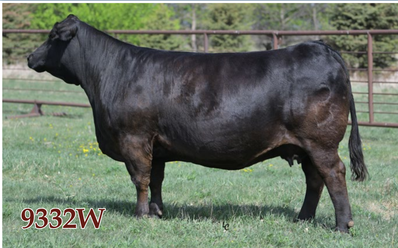
CCR APPLE 9332W • DONOR DAM OF LOTS 111, 111A AND 111B