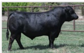
BCLR MANIFESTO G352 SIRE OF LOT 112B