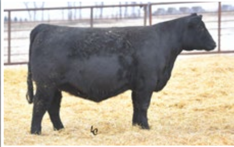
BCLR MISS IMAGE E761