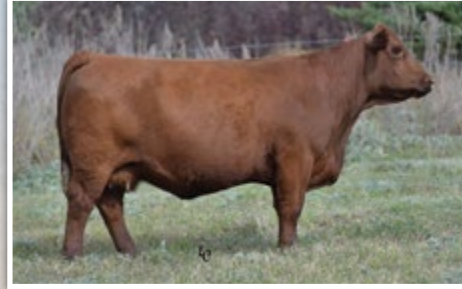
KS ZADA Z887