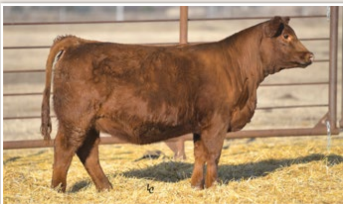
BCLR MISS YANKEE F871 • DAM OF LOT 66