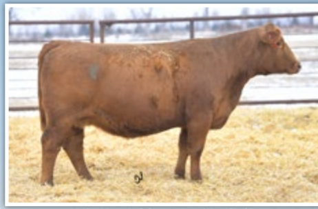
BCLR MISS RED EYE C587

Every cow and bred heifer is a part of the offering, including these elite matrons. Buyer takes choice.