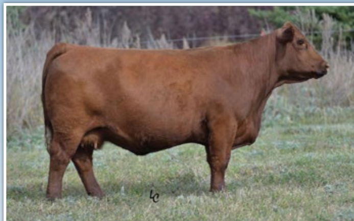
KS ZADA Z887 • DAM OF LOT 56

A beast of a bull. Flush mate to BCLR Forge who we utilized extensively in our 2022 breeding season. This bull has more power and performance than his brother and should produce some excellent replacement females. Dam is Zada donor.