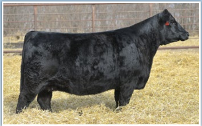
ELLIOT MISS E352 • DAM OF LOTS 25-28