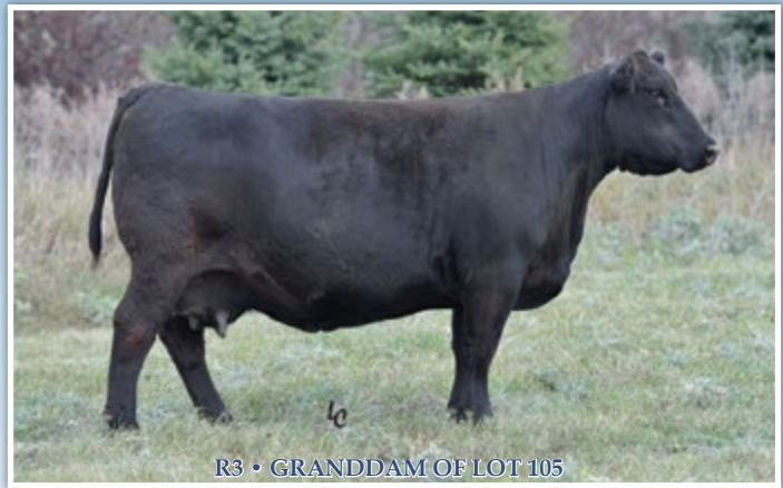
R3 • GRANDDAM OF LOT 105