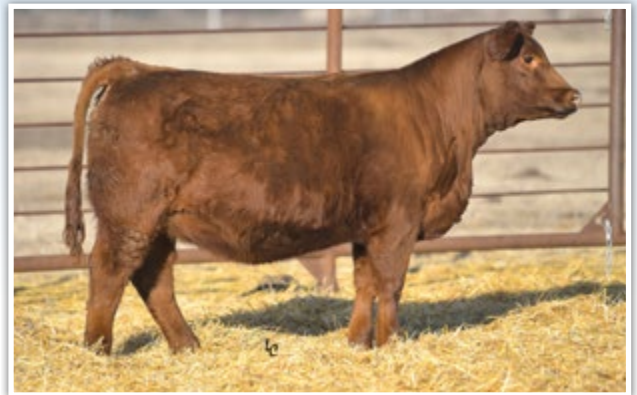
BCLR YANKEE MISS F871