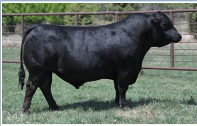
BCLR MANIFESTO G352 • SIRE OF LOTS 33-42