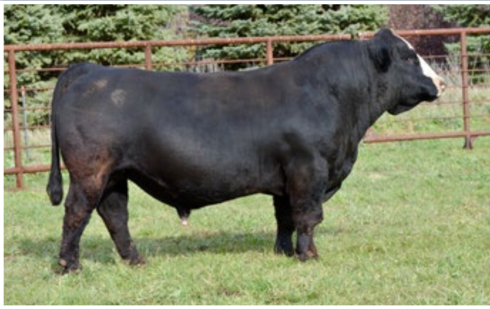
HHS INTUITION 841F • SIRE OF LOT 102-103 AND 106