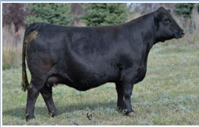
WS MOTHER LOD E W21 • MATERNAL GRANDDAM OF LOT 99