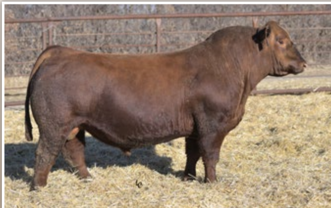
9 MILE ABUNDANCE 7507 • SIRE OF LOTS 1-3

What a start to the catalog. This is definitely one of 38W's most complete sons to date. Study his performance data then combine that with his balanced EPDs and his impressive phenotype and you have a unique herdbull prospect.