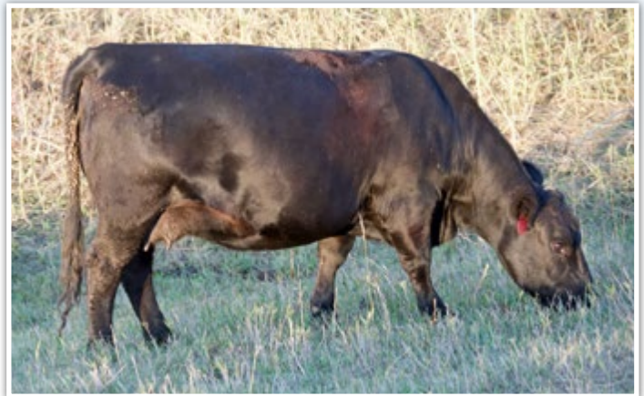
BCLR MISS HOMERUN D607 • DAM OF LOT 98