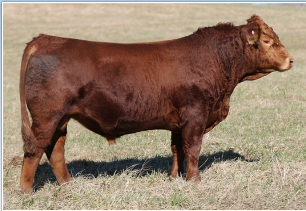
REDHILL 407C 268D 342F