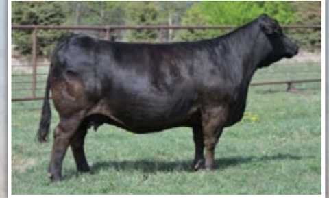
CCR APPLE 9332W