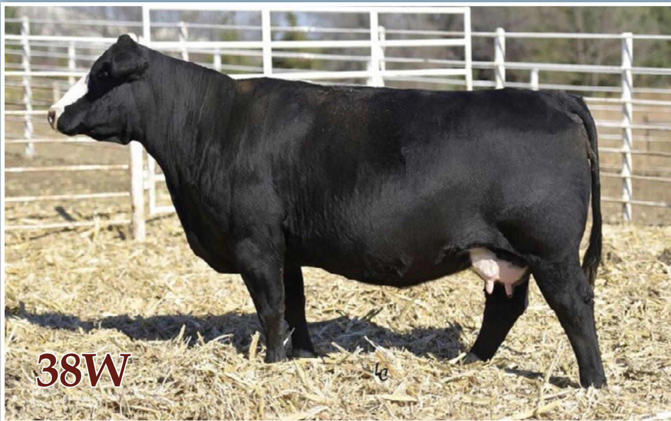
TJ MS 38W • DAM OF MANY LOTS IN THIS SALE • DONOR DAM OF LOTS 112A-112F