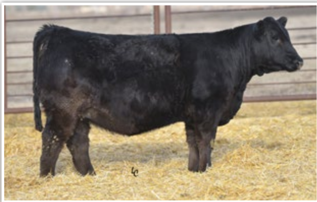
BCLR MISS INNOVATOR F820