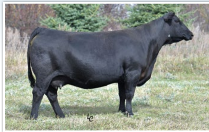
KS S MISS T552 • DAM OF LOT 90