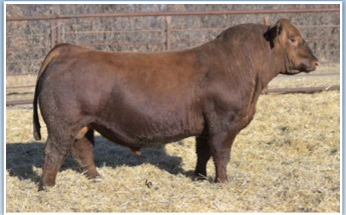
9 MILE ABUNDANCE • SIRE OF LOTS 47-48