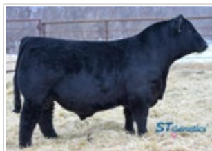
CDI TRUSTEE 387F SIRE OF LOT 112C-112D