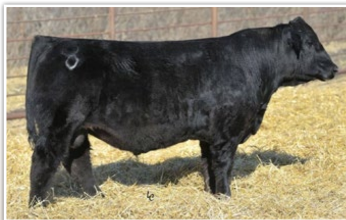
LCDR PROGRESSIVE 106G