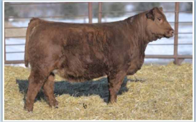
BCLR MISS AUTHORITY G931

These heifer calves represent the depth and quality of the offering. All of the heifers pictured here have gone on to be donors for our herd and others.