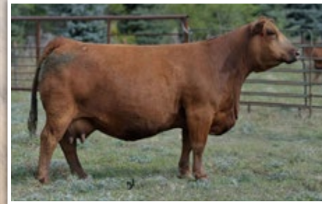
HOOK'S YANKEE 38Y