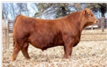
ROCKIN H CAPTIVATE J75 SIRE OF LOT 112A