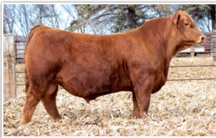
ROCKIN H CAPTIVATE J75 • SIRE OF LOT 110A