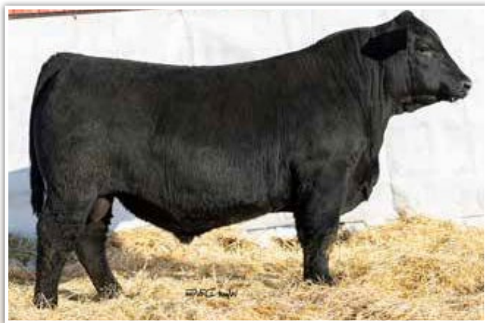
GW JAILBREAK 555J • SIRE OF LOT 111A