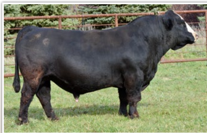
HHS INTUITION 841F