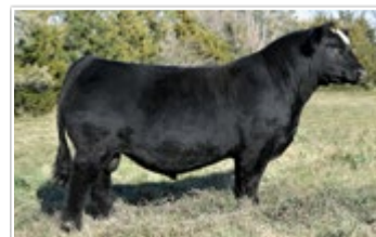
W/C FORT KNOX 609F SIRE OF LOT 112E-112F

Selling a package of 3 conventional embryos for each lot, with one guaranteed pregnancy, if work is done by a certified embryologist.