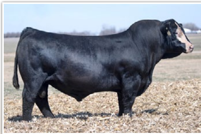
MR SR MIC DROP G1534 • SIRE OF LOT 111B

Selling a package of 3 IVF embryos for each lot, with one guaranteed pregnancy, if work is done by a certified embryologist.