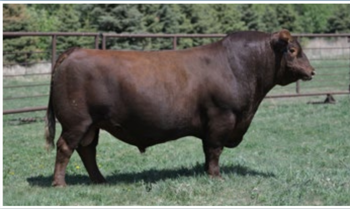
LCDR INTRIGUE 749R • SIRE OF LOTS 66-77