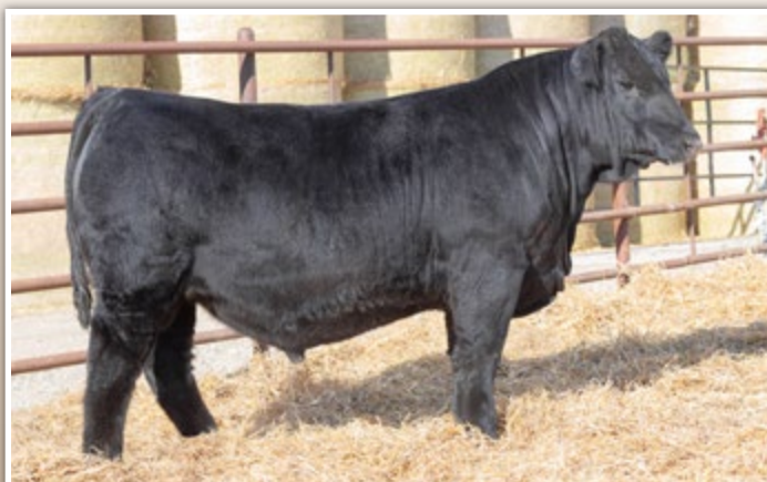
HOOK'S FULL FIGURES 11F • SIRE OF LOTS 45-46

These bulls are so tame that Therez has claimed them as her own. They have a unique pedigree. Out of our F820 donor who has a good disposition as well and a great udder.