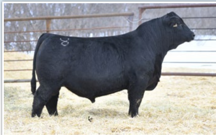
LCDR MAKIN' WAVES 711E • SIRE OF LOT 58