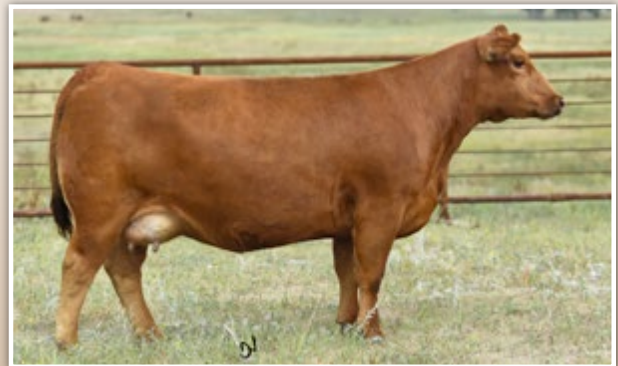
CDI 80Z • PATERNAL GRANDDAM OF LOTS 60-62