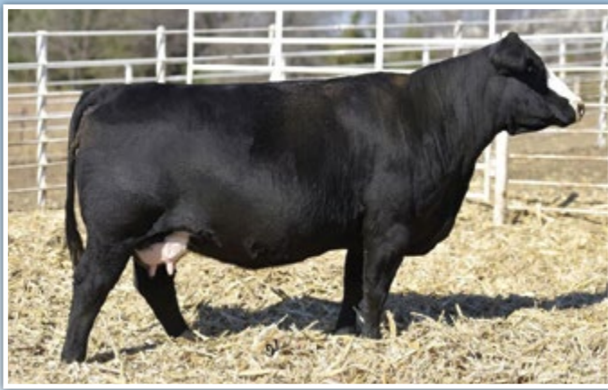
TJ MS 38W • DAM OF LOTS 47-48