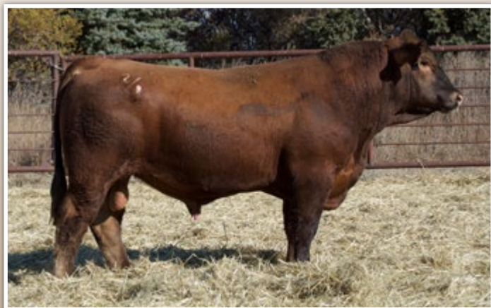
BCLR FORGE J8871 • SIRE OF LOT 110B

Selling a package of 3 IVF embryos for each lot, with one guaranteed pregnancy, if work is done by a certified embryologist.