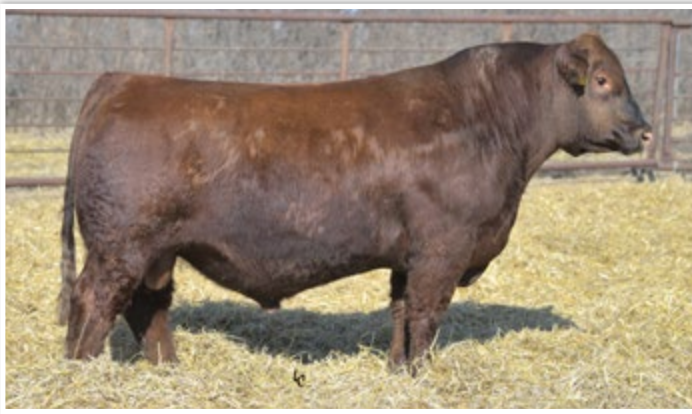
9 MILE MOTLEY 8505 • SIRE OF LOTS 78-80