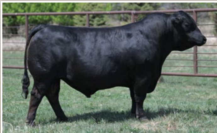
BCLR MANIFESTO G352 • SIRE OF LOTS 86-90