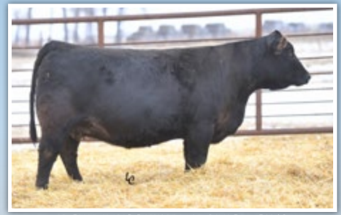
BCLR MISS WIDE RANGE C563