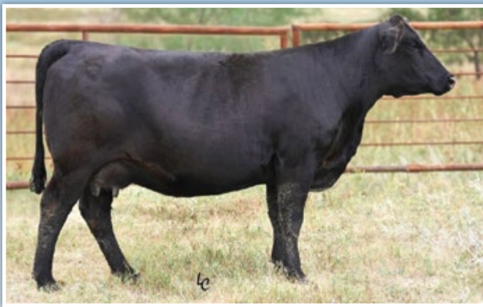
BCLR MISS TESSA Z219 • DAM OF LOT 93