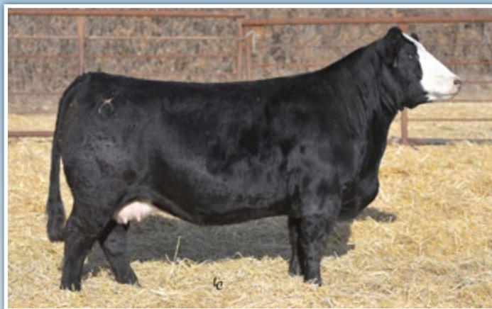
HHS MISS 836Z • DAM OF LOTS 29-32