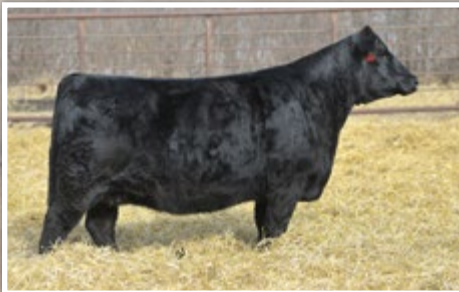
ELLIOT MISS E352