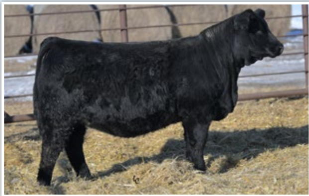
BCLR MISS DAKOTA G910